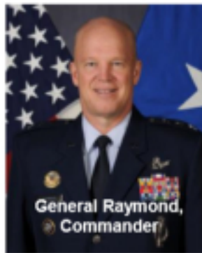
General Raymond, Commander