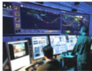
Schriever Air Force Base